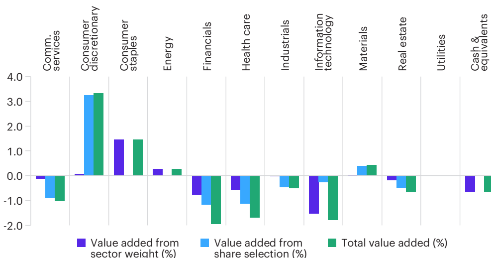
U.S. LARGE CAP GROWTH FUND VERSUS RUSSELL 1000® GROWTH INDEX