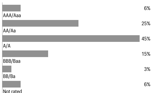
CREDIT QUALITY AS OF JUNE 30, 2023 1

In the wake of continued rate increases, U.S. fixed income yields rose dramatically as investors reacted to Fed actions, with the yield on the 10-year Treasury ending the period near 4%. Rising Treasury yields affected all fixed income sectors in 2022, with all seeing their worst returns in more than 40 years. The U.S. Treasury yield curve remained substantially inverted throughout the period, which has driven many investors into shorter-term interest-bearing vehicles, including money markets.